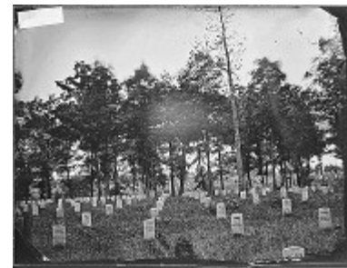
Soldiers buried at Arlington Cemetery

In January 1865 – three months before the war ended – Congress passed the 13th Amendment to the Constitution, outlawing slavery in the United States. The war ended when the Confederacy surrendered in April 1865. After that, all states were once again part of the United States of America. In December 1865, slavery was finally abolished in the entire United States when the last state ratified (passed) the 13th Amendment.